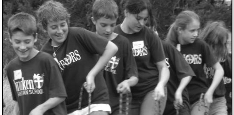
Fifth graders learn the importance of teamwork to accomplish a task!