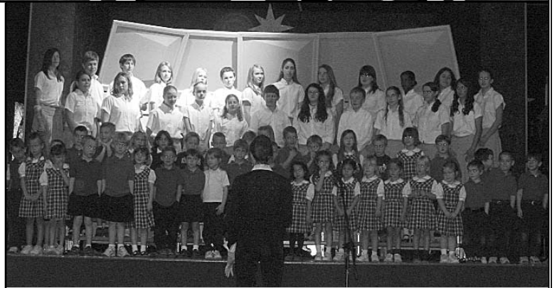
Bracken Praise Choir debut performance with K-4 and K-5 classes on Grandparents Day.