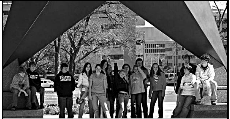
Bracken 7th graders recently headed to the Bob Bullock Texas History Museum in Austin.